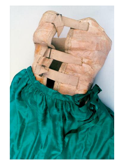
8. MIYAKO ISHIUCHI, FRIDA BY ISHIUSHI # 16, 2012. © MIYAKO ISHIUCHI