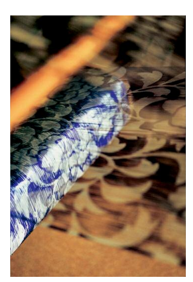
11. MIYAKO ISHIUCHI, SILKEN DREAMS # 1, 2009–2012. © MIYAKO ISHIUCHI

10. MIYAKO ISHIUCHI, MOTHER'S # 52, 2000–2005. © MIYAKO ISHIUCHI