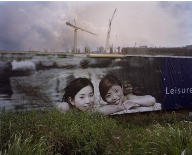
03_ Leisure, 03/30/2007