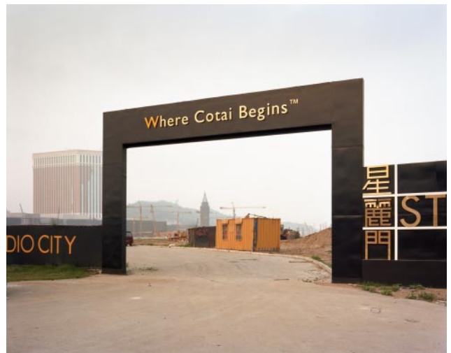
12_ Cotai Construction Entrance, 03/02/2007