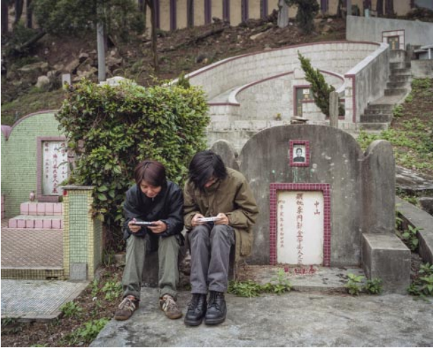
07_ Teens on Grandma's Grave During Qingming Festival, 04/05/2007 © Adam Lampton