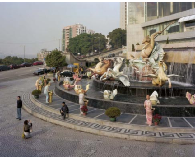
11_ The Greek Mythology Casino Fountain, 01/24/2007