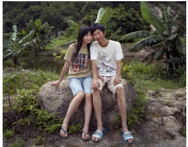
04_ Teenage Couple, Hengqin, Zhuhai 05/06/2007