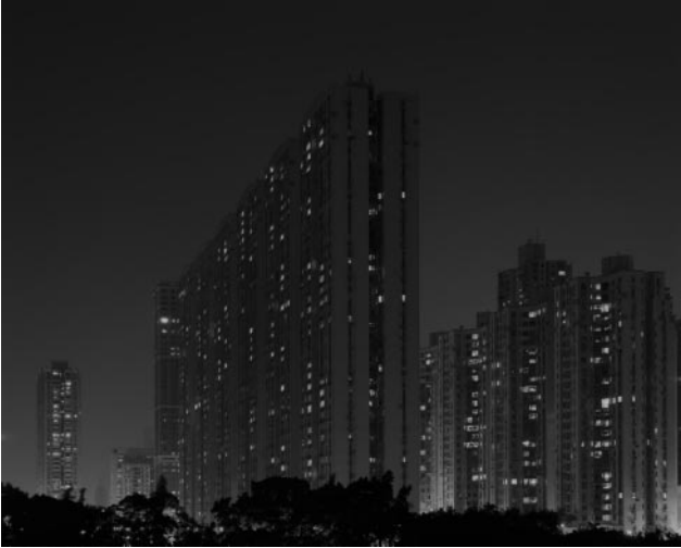
01_ Apartment Buildings at Night, Taipa, 12/01/2006