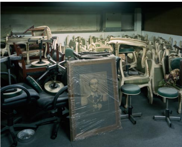
05_ Portrait in the Dom Pedro V. Theatre Basement, 12/12/2006