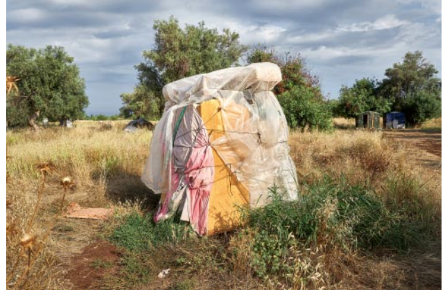
o2_ © Alberto Gandolfo