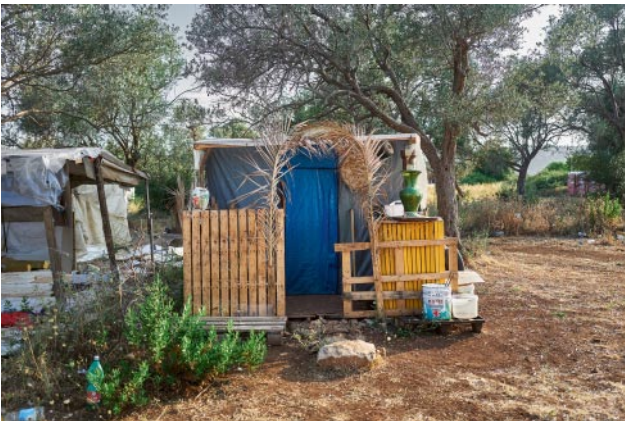
o3_ © Alberto Gandolfo