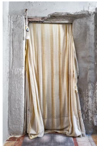
o6_ © Alberto Gandolfo