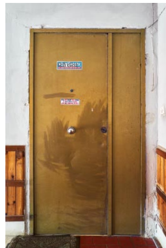
10_ © Alberto Gandolfo