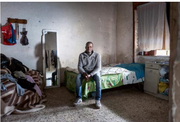
o5_ © Alberto Gandolfo