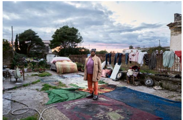
o4_ © Alberto Gandolfo