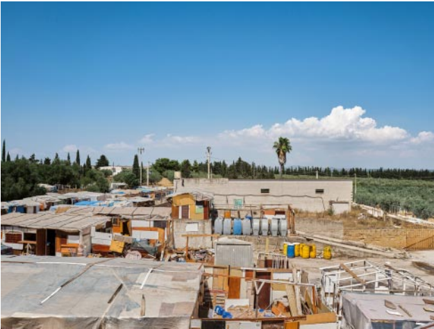
o1_ © Alberto Gandolfo