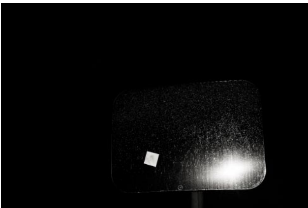
03_ © Anton Roland Laub and VG Bild-Kunst, Bonn 2022