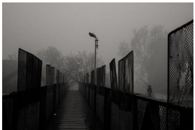
12_ © Anton Roland Laub and VG Bild-Kunst, Bonn 2022