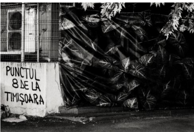
11_ © Anton Roland Laub and VG Bild-Kunst, Bonn 2022