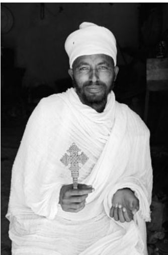
05_ A young monk, holding his hand cross, Ethiopia, 2011