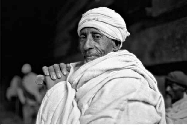
07_ Ethiopian Orthodox Christian, church of Yemrehana Krestos, north of Lalibela, Ethiopia, 2011