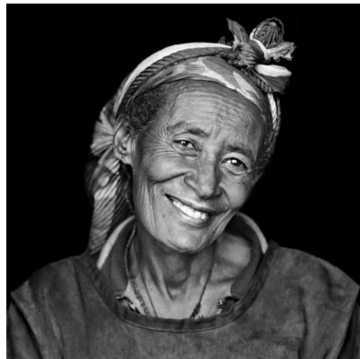
06_ Worldid or "Black Lady", as we named her, Gondar market, Ethiopia, 2011