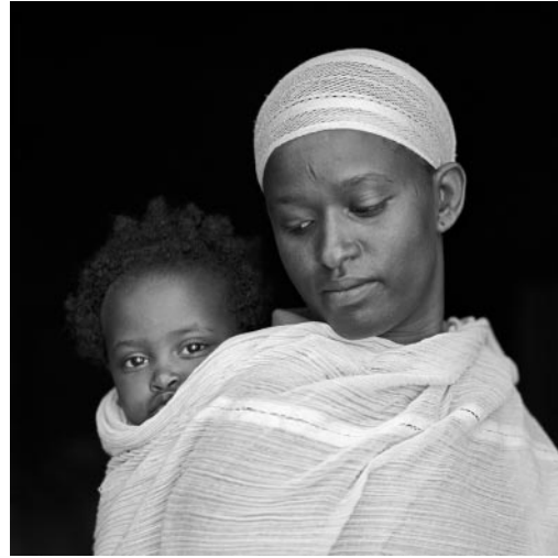
02_ Mother and child, community of Beta Israel, Gondar, Ethiopia, 2011