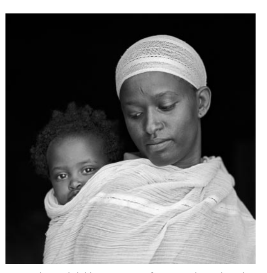
02_Mother and child, community of Beta Israel, Gondar, Ethiopia, 2011