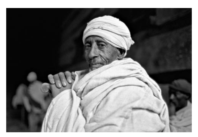
07_ Ethiopian Orthodox Christian, church of Yemrehana Krestos, north of Lalibela, Ethiopia, 2011