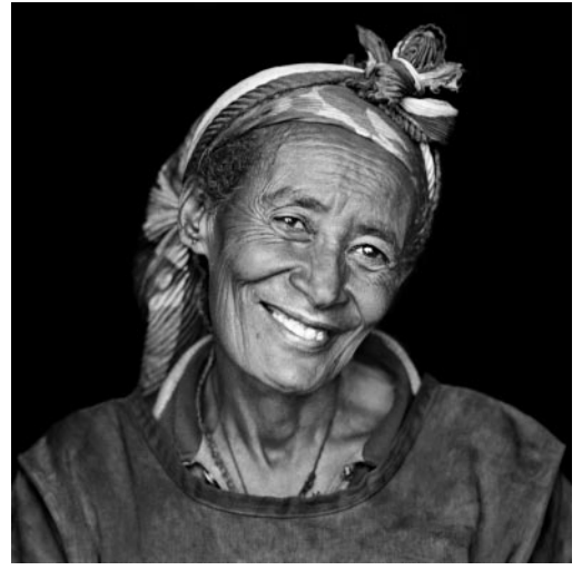
o6_Worlid or "Black Lady", as we named her, Gondar market, Ethiopia, 2011