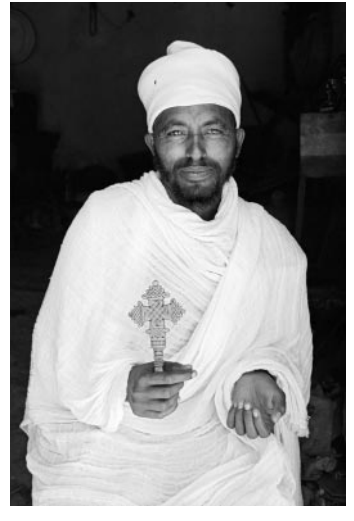
o_5\_ A young monk, holding his hand cross, Ethiopia, 2011