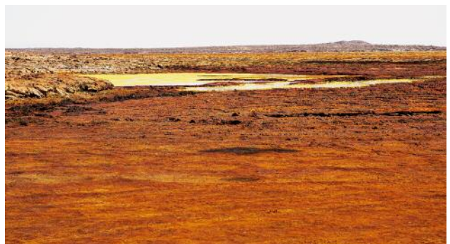
6 © Ulrike Crespo