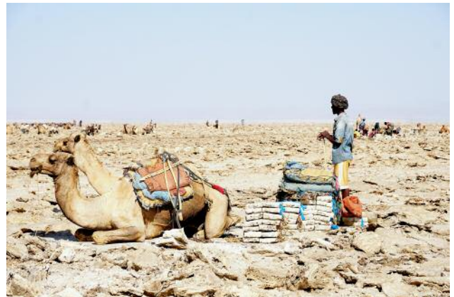
10 © Ulrike Crespo