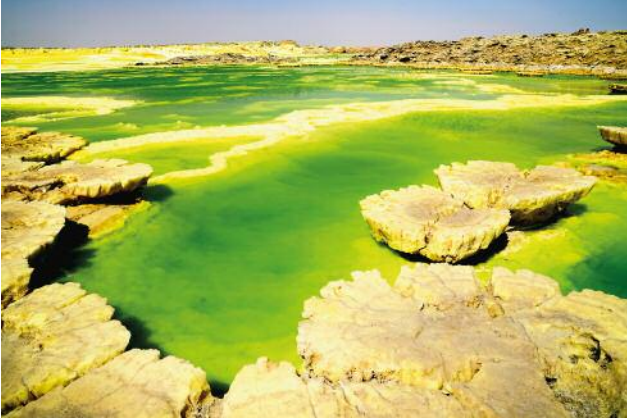
7 © Ulrike Crespo