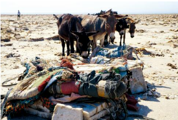
3 © Ulrike Crespo