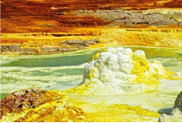
1 © Ulrike Crespo