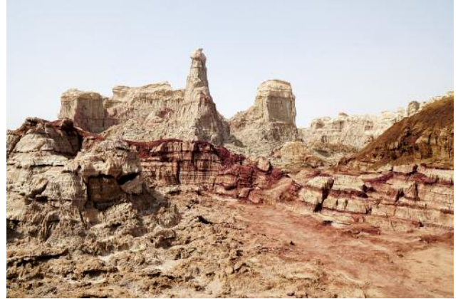
8 © Ulrike Crespo