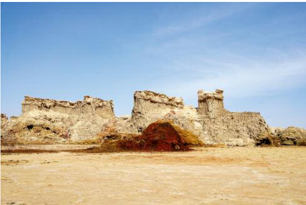
9 © Ulrike Crespo