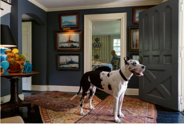
07_ Easton, Pennsylvania