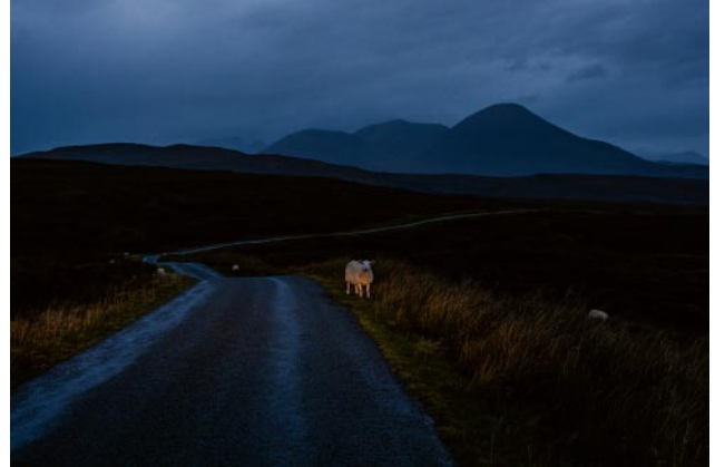
02_ Isle of Skye, Scotland