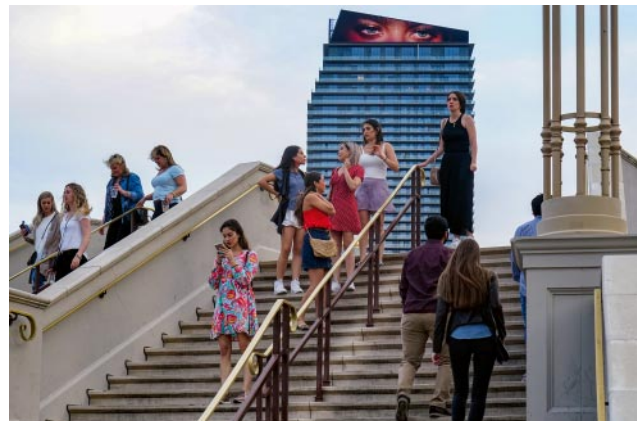
12_ Las Vegas, Nevada