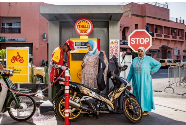
05_ Marrakesh, Morocco