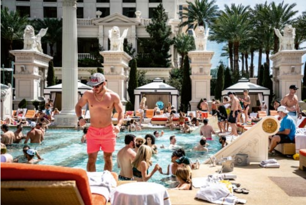
01_ Ceasars Palace, Las Vegas, Nevada