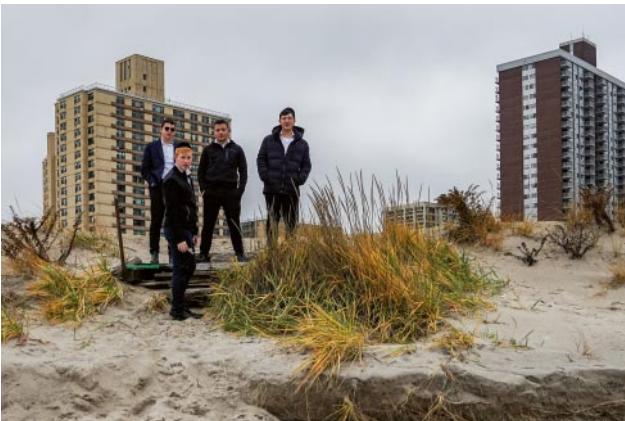
09_ Far Rockaways, New York - On assignment: Dior TV commercial