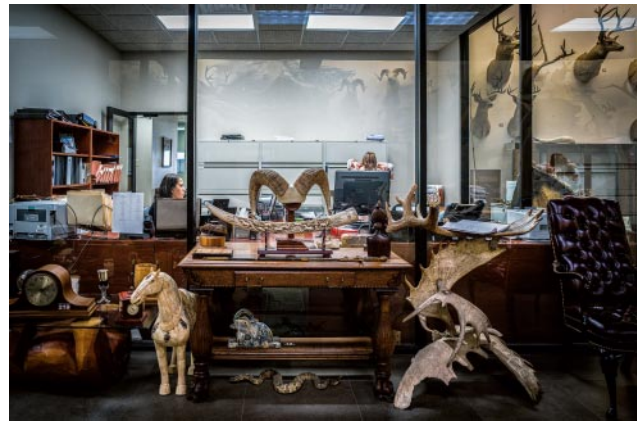
10_ Corsicana, Texas