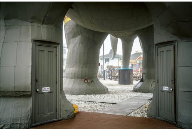
11_ Margate, New Jersey - On assignment: Hightown, Starz Network TV Series