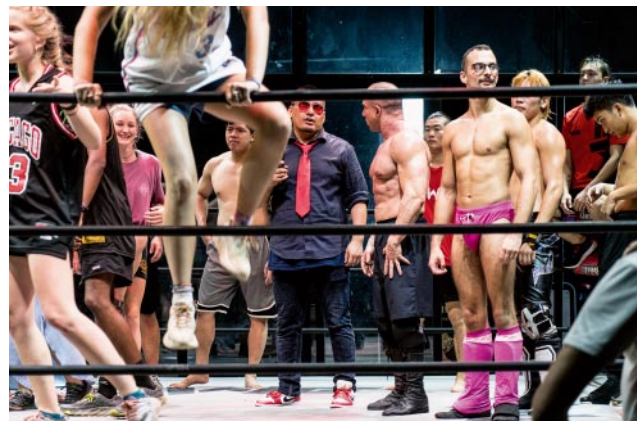
04_ Pro-Wrestling Arena, Siem Reap, Cambodia