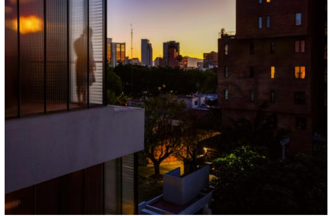
08_ Guadalajara, Mexico