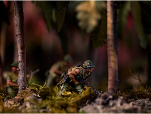
07 © David Levinthal