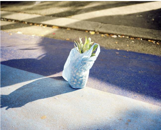
Press image 9