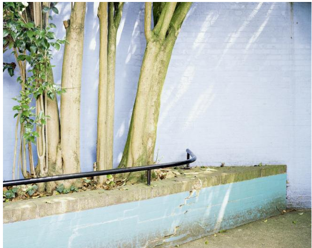
Press image 10