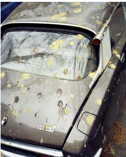
Press image 5