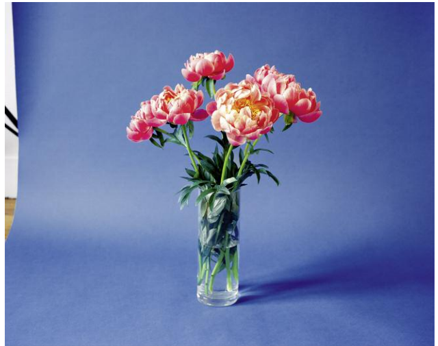
Press image 4