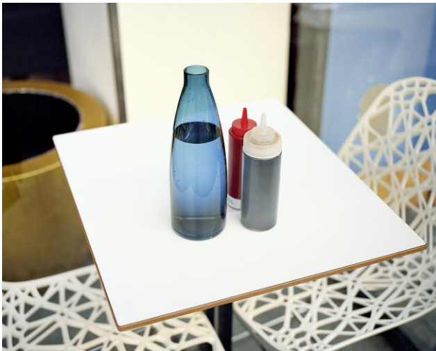
Press image 3 © MARTIN ESSL