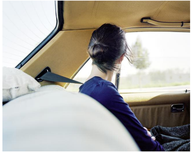
Press image 8 © MARTIN ESSL