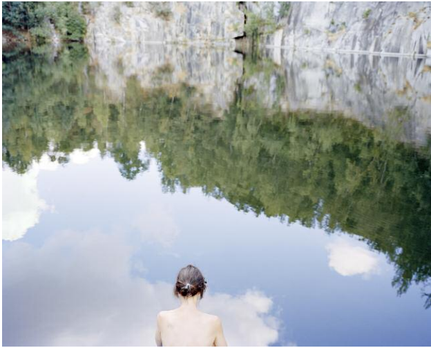
Press image 7