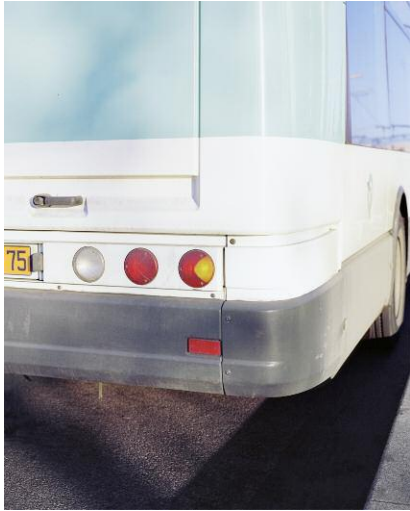
Press image 1 © MARTIN ESSL