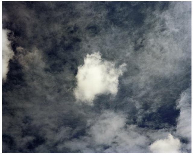
Press image 2 © MARTIN ESSL