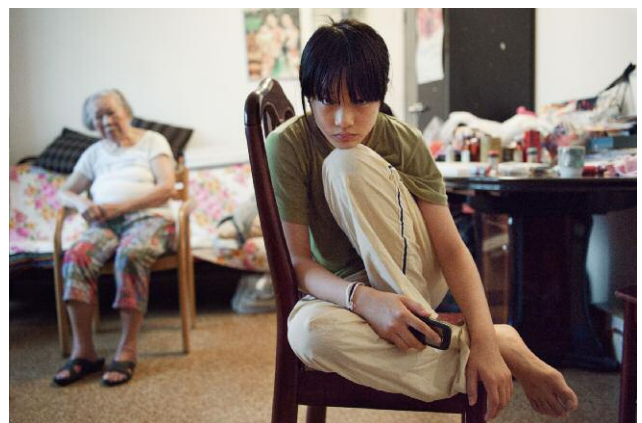
06_Bored