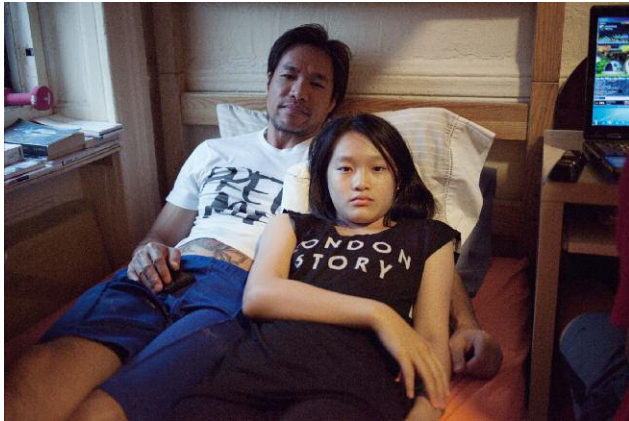
01_A Father's Touch