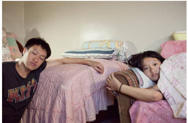
10_Five Days Before College