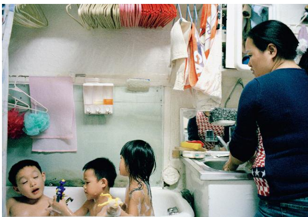
05_Bath Time