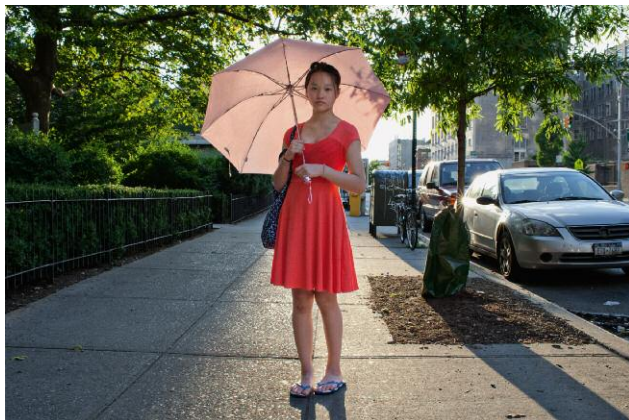
03_After Swimming ©Thomas Holton