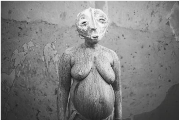
07_God Bless my son, Maputo, Mozambique, 2015