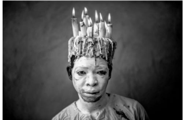
08_A Candle Man, Inhambane, Mozambique, 2021