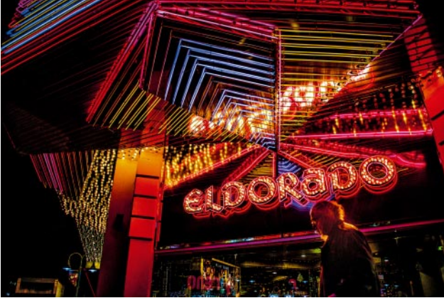
07_