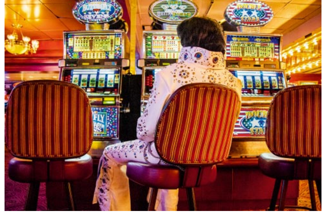
02_