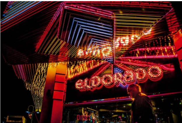
09_