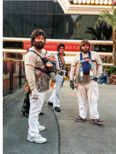
08_