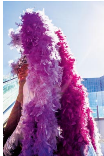
10_