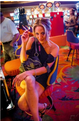
11_