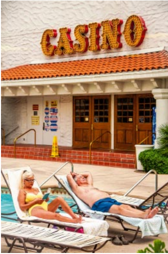
01_