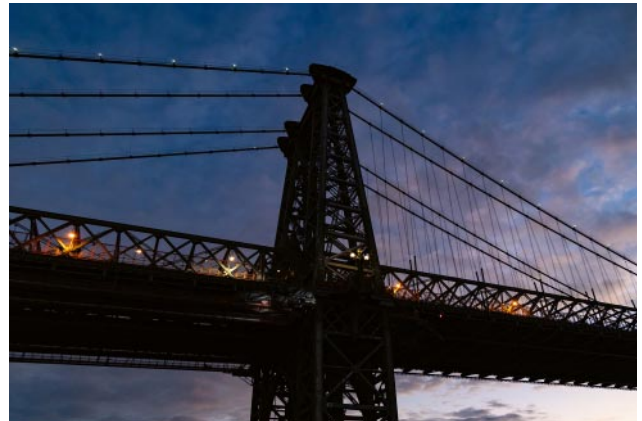
10_ © Pamela Thomas-Graham