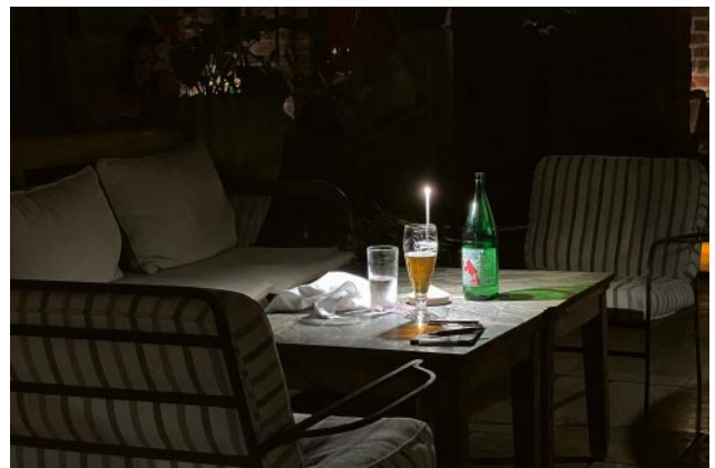
12_ © Pamela Thomas-Graham