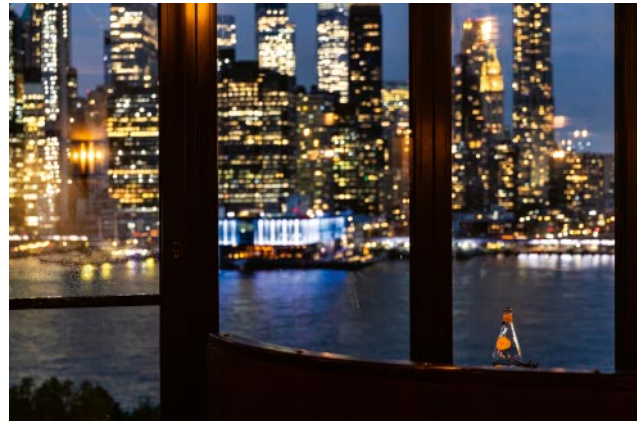
04_ © Pamela Thomas-Graham