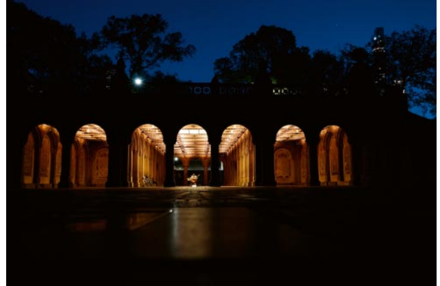
08_ © Pamela Thomas-Graham