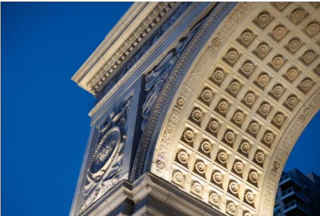
09_ © Pamela Thomas-Graham