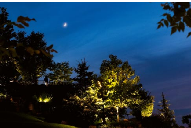
11_ © Pamela Thomas-Graham