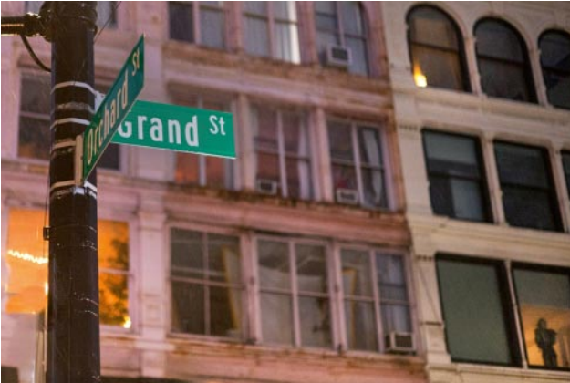
01_ © Pamela Thomas-Graham