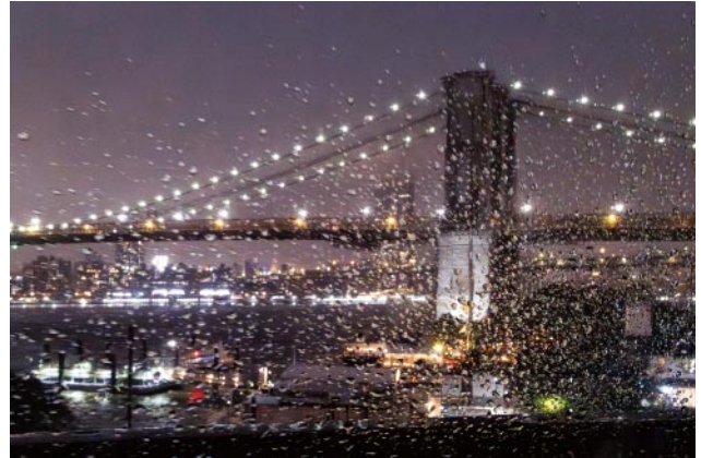
02_ © Pamela Thomas-Graham