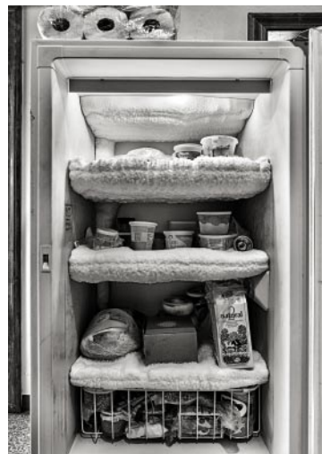
04_ The Freezer Before I Defrosted It