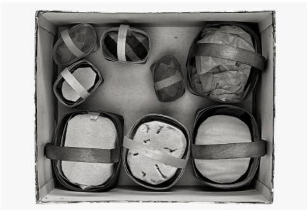
11_ Straw Baskets with Oasis Inserts