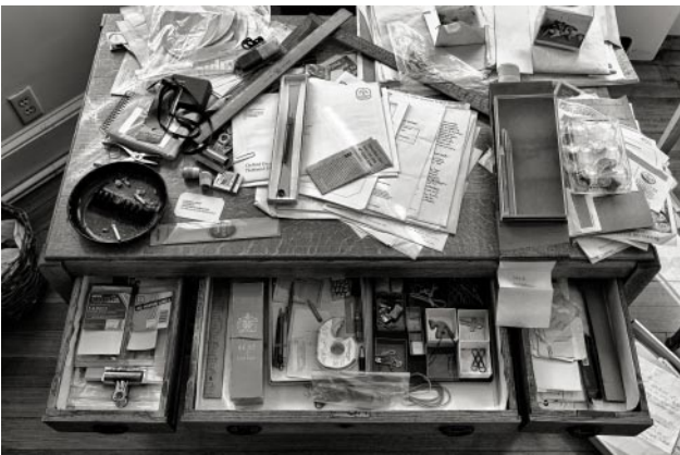
09_ My Mother's Desk, As She Left It