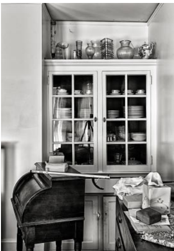
03_ My Mother's Bedroom, After I Moved Her Downstairs