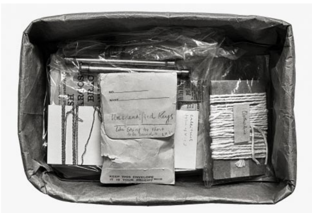
05_ Unidentified Keys