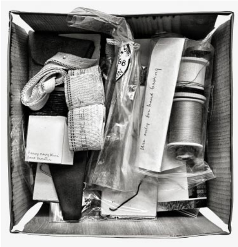
01_ Use Only for Hand Basting