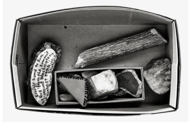
08_ Souvenir Rocks with Felt Glued on Bottom, Heart of the Rowan Tree © Russell Hart