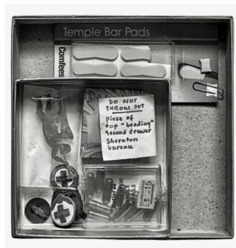
06_ Do Not Throw Out © Russell Hart