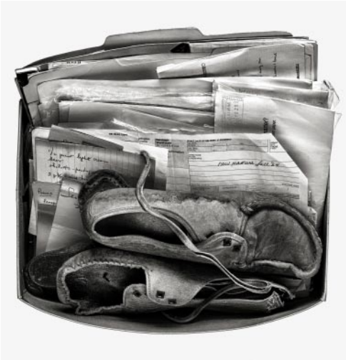
07_ 1/2 Pint Light Cream, New Mattress, Poems