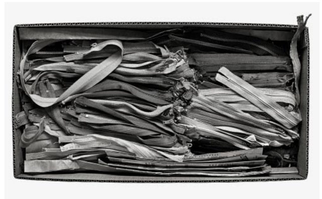
12_ Saved Zippers © Russell Hart