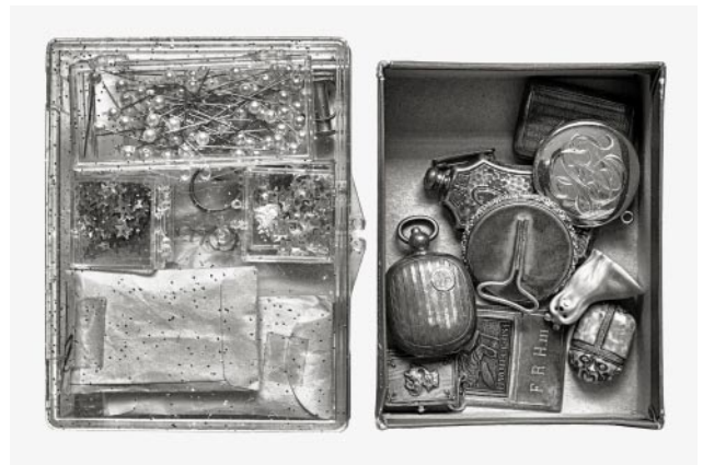
10_ Hatpins, Stars, and Locketts © Russell Hart