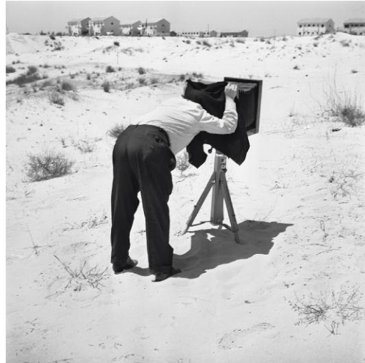
2 A Photographer on the dunes, 1962