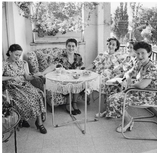
10 Reception at Polish Consul's Home, Tel-Aviv, 1948