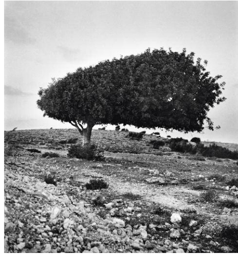
8 Sycamore Tree, Sinai Desert, 1973