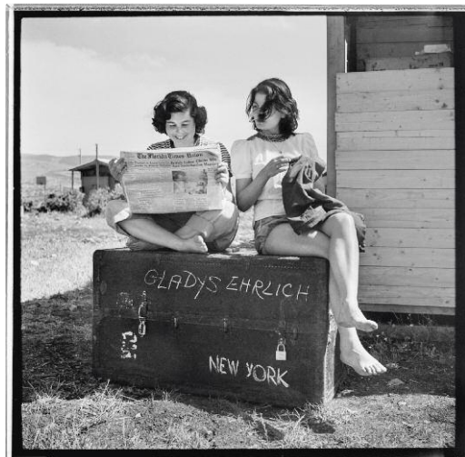
3 New Immigrants, Kibbutz HaSolelim, 1950