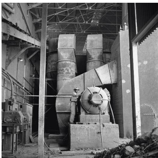
5 "Nesher" Malt Factory, Beit-Shemesh, 1953