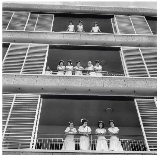
6 Hospital, Beer-Sheva, 1963