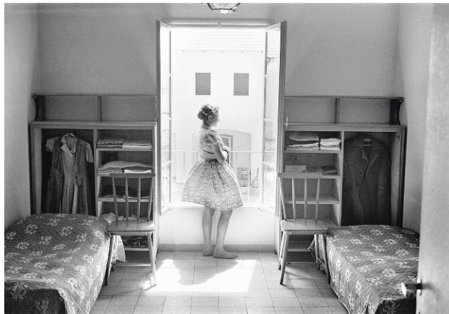
9 A Room in Kfar Batya for Child Survivors of the Holocaust, Ra'anana, 1947