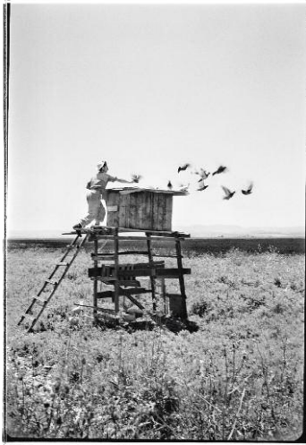
7 Farmer, Afula, 1950