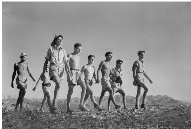
11 Youth, Eilat, 1949