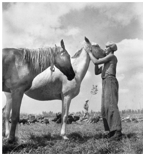
12 Horses, Giv'at Haim, 1941