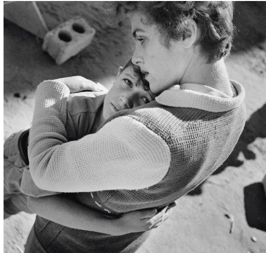
4 Film Studios, 1952