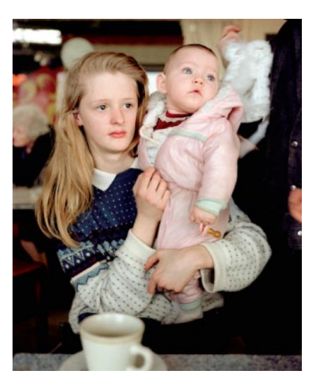
o5_Tom Wood, Titian Mother , 1985