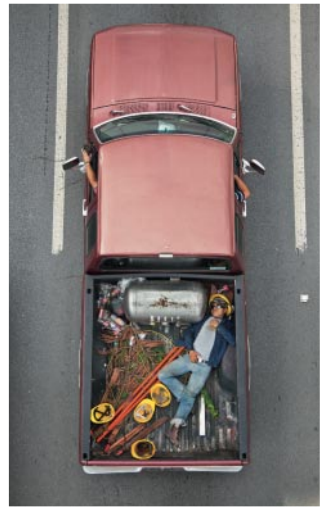
03_Alejandro Cartagena, Carpoolers #24, from the series Carpoolers, 2011–2012