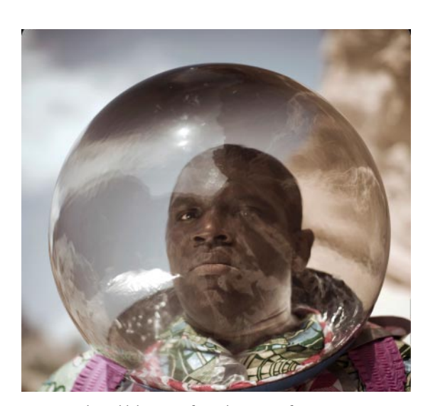
11_Cristina de Middel, IKO IKO from the series Afronauts 2012