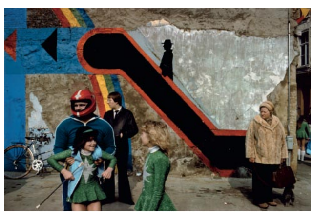
10_Harry Gruyaert, Carnival, Antwerp, Belgium, 1992