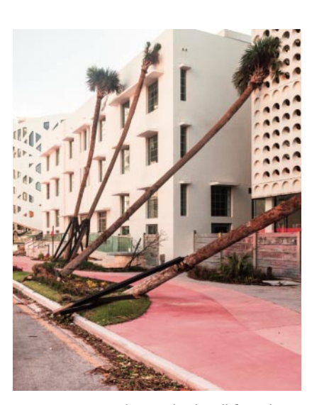
12_Anastasia Samoylova, Pink Sidewalk from the series FloodZone 2017