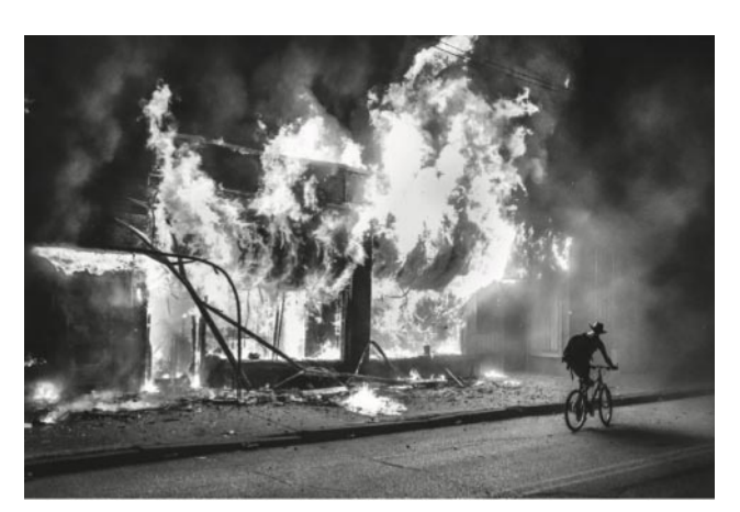
og_Philip Montgomery, Protests for George Floyd #5, Minnesota 2020