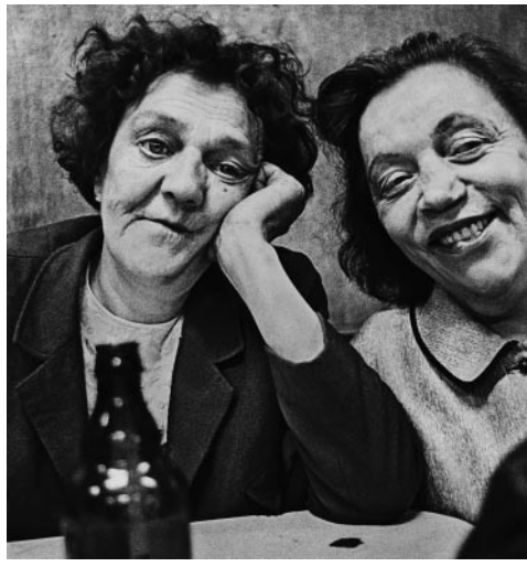
04_Anders Petersen: Untitled, from the Series 'Café Lehmitz' 1970