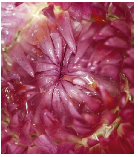
o6_ Maisie Cousins, Bumhole , 2015